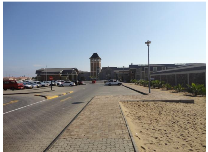
Sites and services in Swakopmund

On the past month of June, a mission to Namibia and eThekweni municipality took place. Parallel, a mentoring workshop was held in Swakopmund, the first debt free town of Namibia. A city changer story will soon be published for you to know & share the experience of this town in relation to the provision of basic services.