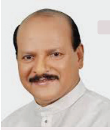
Chief Minister Sarath Ekanayake, leader of the Sri Lankan delegation