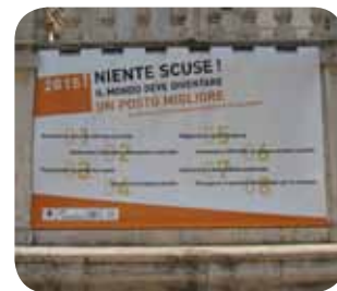
MDGs Campaign: Paris - Buenos Aires - Rome